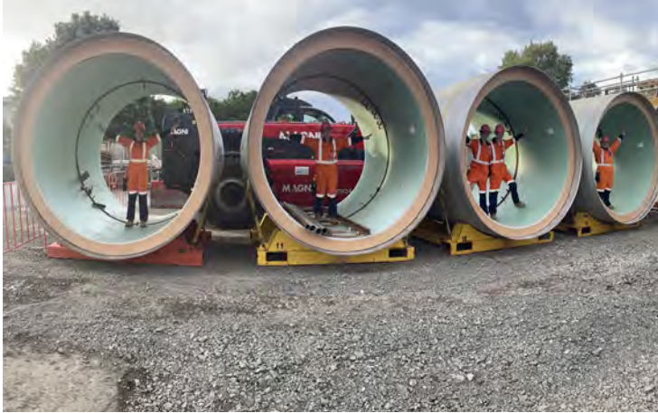
Ranger guide site visit