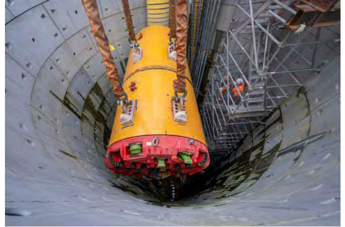
Domenica being lowered down the shaft