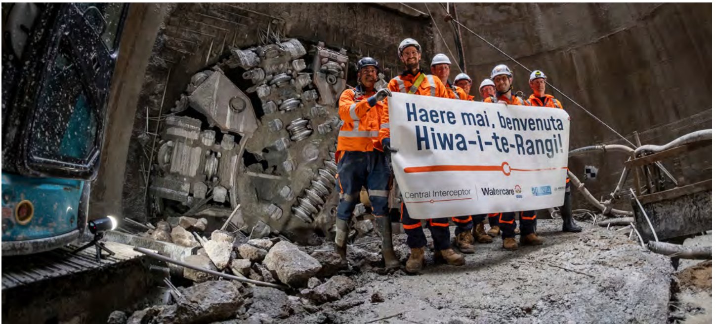
In September, our main tunnel TBM, Hiwa-i-te-Rangi broke through into our May Rd site, completing the southern section of the tunnel